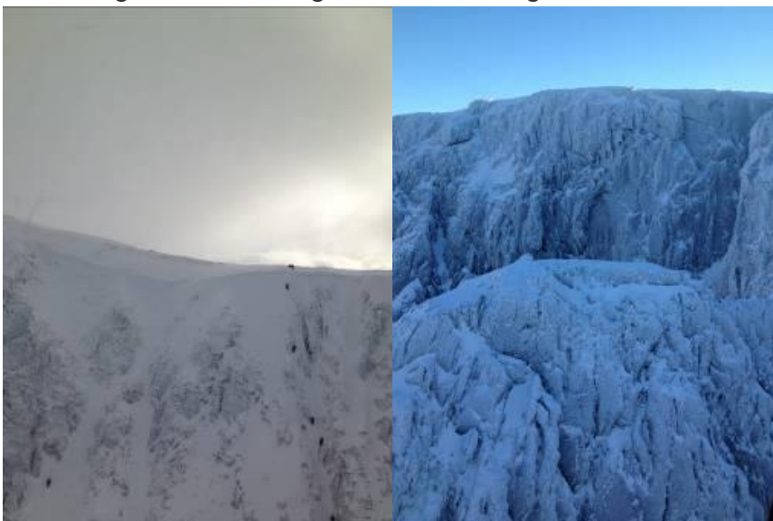
An icy Coire an t-Sneachda and Ben Nevis