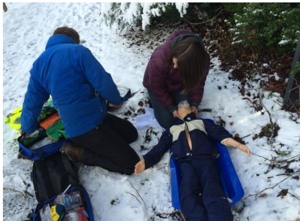
Training on the Remote & Rural Fellowship Programme