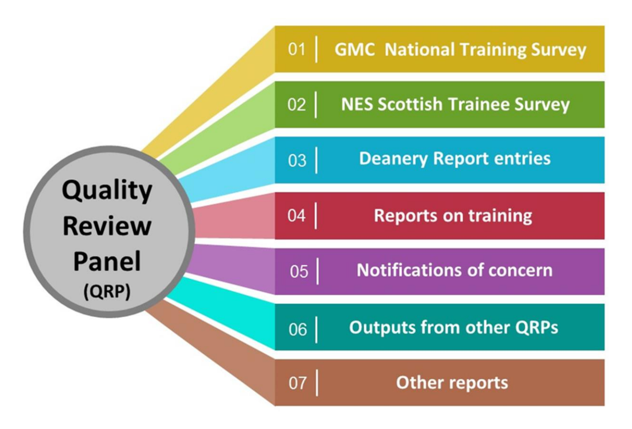
Figure 4: the data, information and intelligence that are considered by sQMGs at their Quality Review Panels.