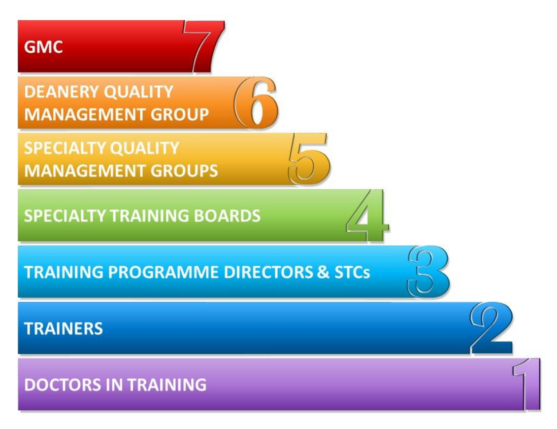
Figure 1: the stairway to QM & QI in Scotland - key players & key structures

The structures that, together, support the delivery of QM-QI in PGMET in Scotland Deanery are depicted in figure 1. The contributions of each step are described in subsequent sections of this chapter.