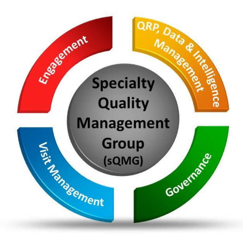
Figure 3: the core functions of the specialty Quality Management Groups

Management of data & intelligence relating to training in their specialties including their Quality Review Panel