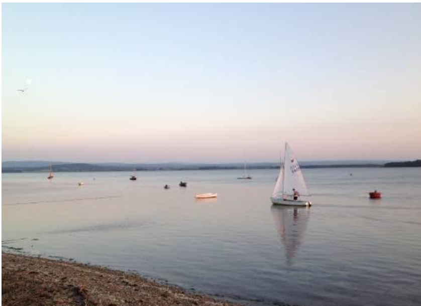
Sailing at Findhorn Bay