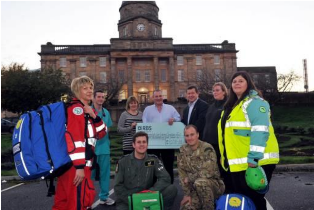
Fantastic donation for the Moray Immediate Care Scheme

You will work alongside our current Emergency Medical Practitioners (EMP's) – experienced General Practitioners (GP's) with additional skills and experience in Emergency Care, many of whom have portfolio careers with other posts in General Practice and specialist areas of interest. Overnight their role includes covering the General Practice Out of Hours (OOH's) Centre which is co-located in recently refurbished accommodation and enjoys the benefits of the rest of the ED team and hospital support. You will work alongside Emergency Nurse / Paramedic Practitioner colleagues working in the community, providing telephone support as required as well as taking advice calls, and be required occasionally to undertake visits yourself in a small number of circumstances. Telephone support from more experienced colleagues in General Practice is also always available via the OOH Hub.