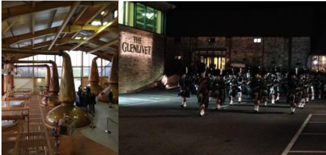
The stills of Glenlivet distillery and beating the retreat