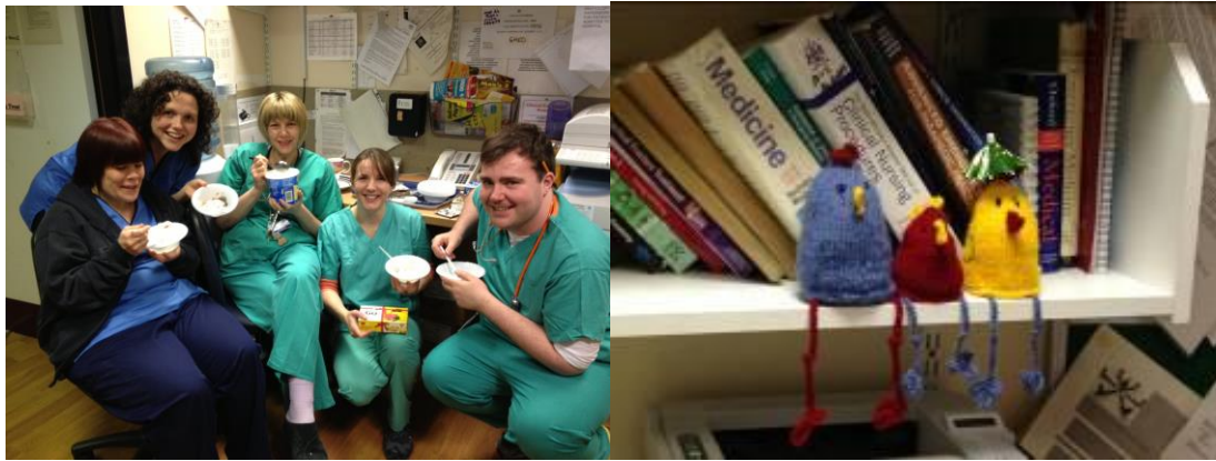
Night shifts can occasionally accommodate jelly and ice cream, and knitting..!

Equally important is the reputation for being the social hub of the hospital, with many social events and activities taking place.