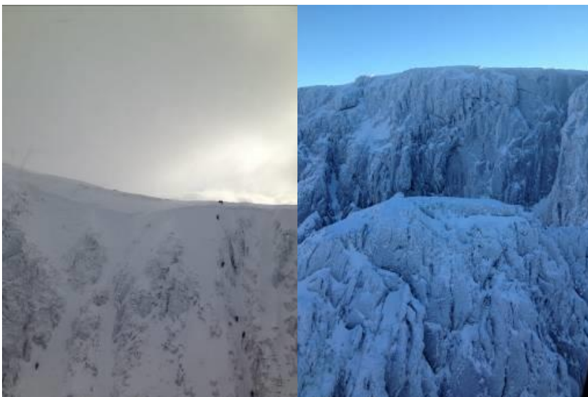
An icy Coire an t-Sneachda and Ben Nevis