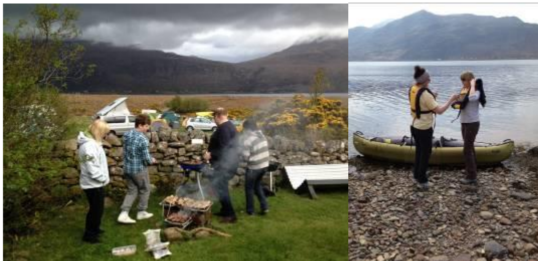
Inaugural 50 Shades of Dr Gray’s Weekend at Little Loch Broom

We enjoy excellent professional relationships with the emergency services as well as the Coastguard Search & Rescue and military Mountain Rescue Team at RAF Lossiemouth. These extend to a wealth of multi-disciplinary training opportunities and social team-building events, the highlight of which is the bi-annual “50 Shades of Dr Gray’s” weekends away – all good clean fun, lots of outdoor activities well away from work and “R&R” guaranteed!